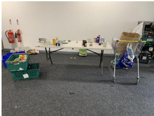
Food being sorted

potential donations. Most needed food supplies are tinned meat, tinned vegetable and UHT milk. A local allotment will donate excess produce to the foodbank and this is delivered on a Wednesday ready for the foodbank opening on Thursday. There is a need to wider promote this to other allotments. Any leftover fresh produce is given to the homeless.