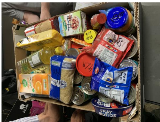
A typical family food parcel for three days